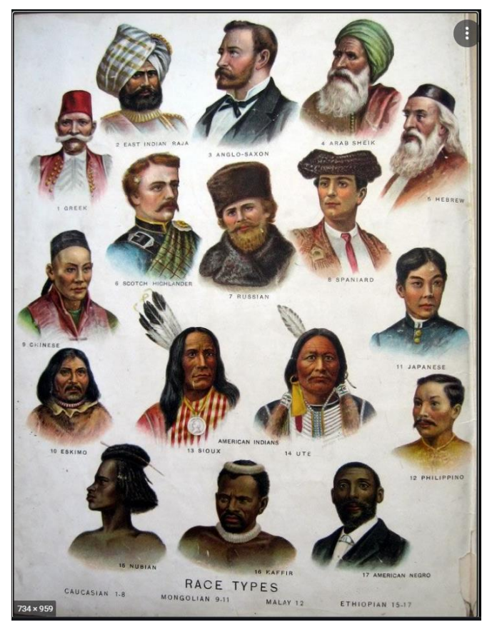
Celebrating Mankind's Diversity